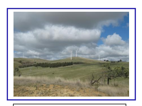
View looking south east to Blayney wind farm from Carcoar Dam Road