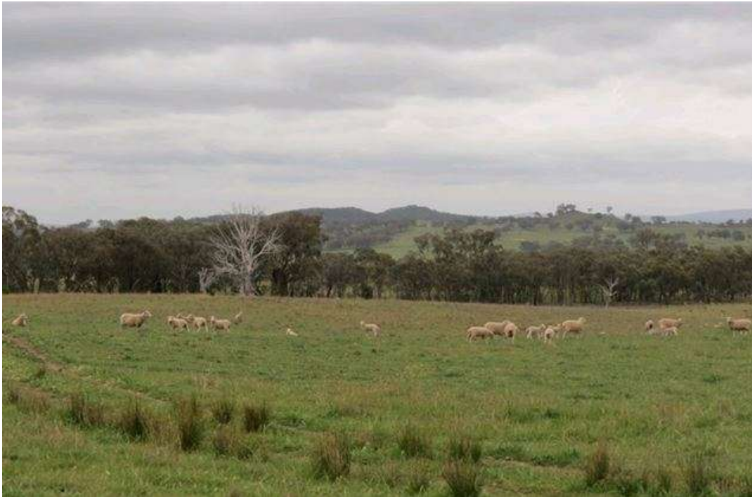
Rural Landscape – Stuart Town District, South of Wellington NSW