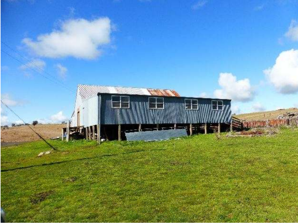
Binda Road - Binda, Upper Lachlan