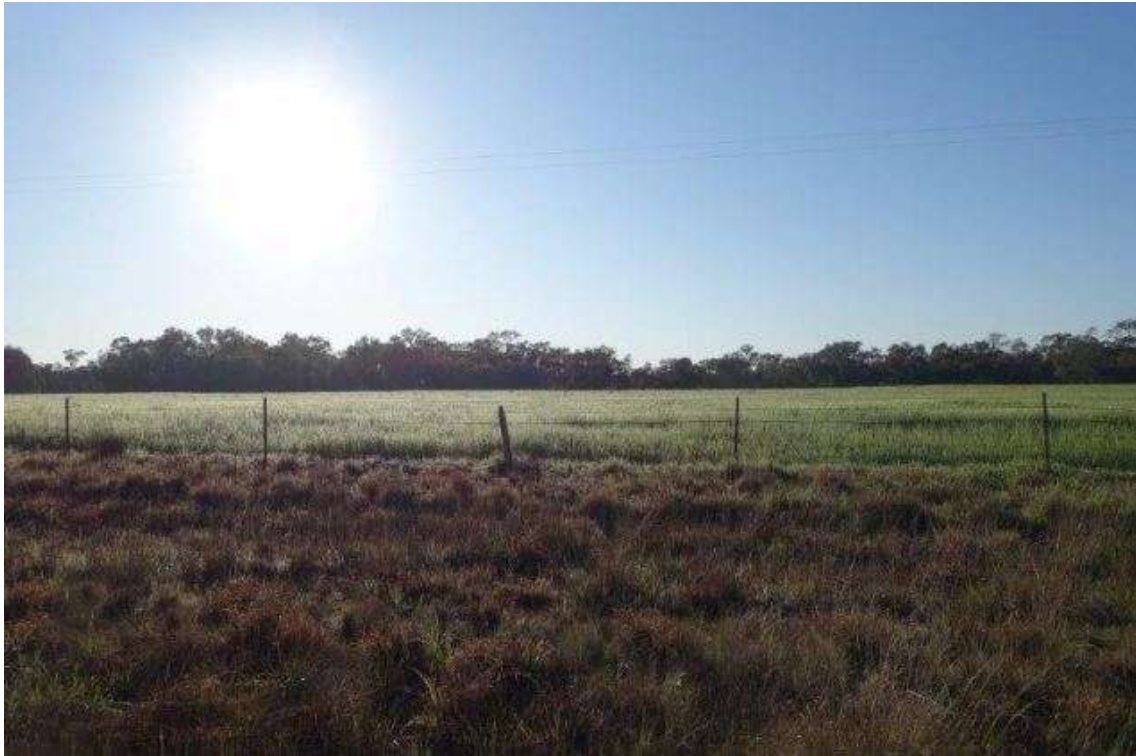
Rural Landscape – Parkes District, Parkes NSW